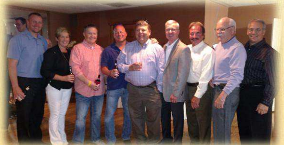
Presidents at the President's Party